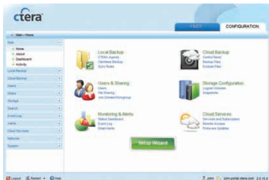
The CloudPlug's easy-to-use Web interface

Connect the Cloud Plug to your router for instant hybrid local & cloud storage, data protection and collaboration